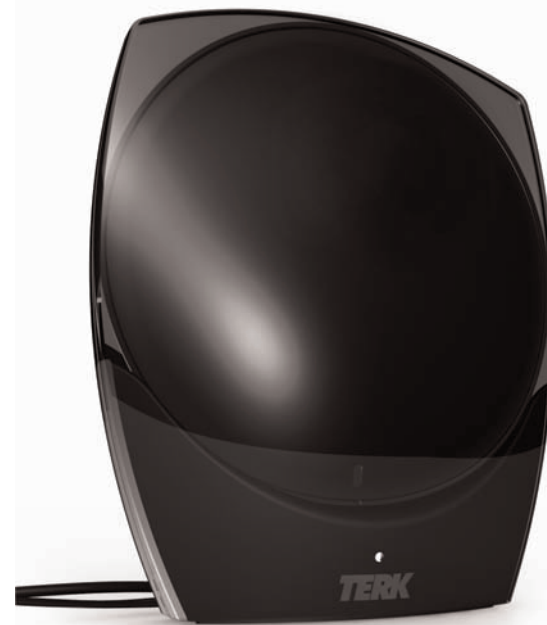
HDR-I Powered Indoor Antenna